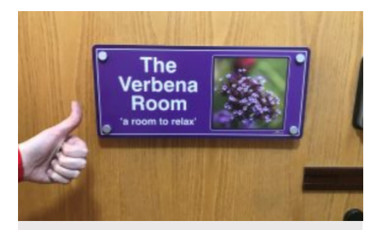
The feedback from the changes has been so positive, that the Hospice Day Therapy Unit is now looking at the same enhancements.

Working closely with Find Memory Care the Hospice introduced clear, contrasting signage to create an environment that facilitated independence and created a supportive environment for both patients and visitors to the unit.